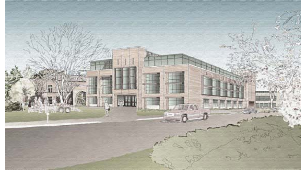
Proposal of new College of Engineering building which will house the Saskatchewan Centre for Masonry Design