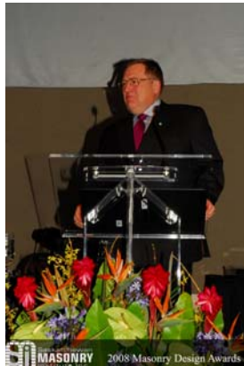
Mayor Don Atchison brings greetings from the City of Saskatoon